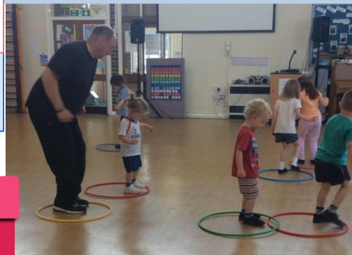
£550 for specialised PE sessions