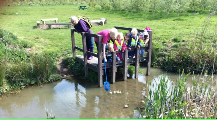
£1500 to provide the annual Forest School sessions for the older children