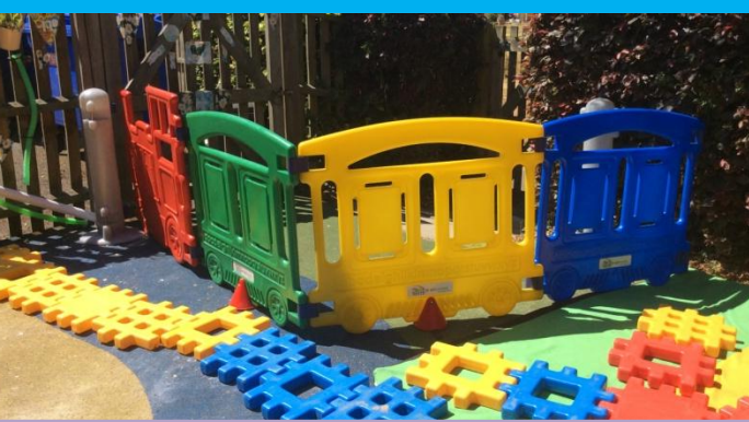
£492 for second train room divider set