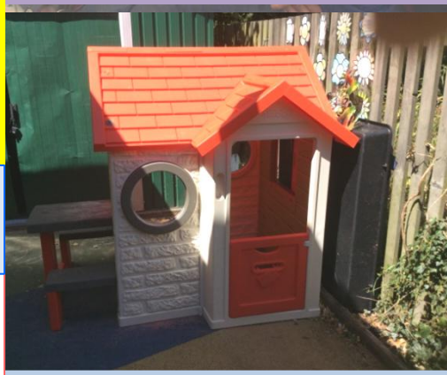
£220 for new playhouse