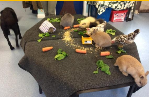
£51 for the annual Life Education Bus session