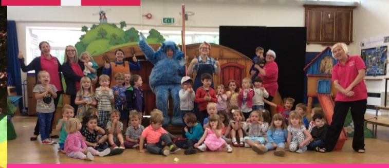
£400 to provide an annual end of term theatre production for all the children