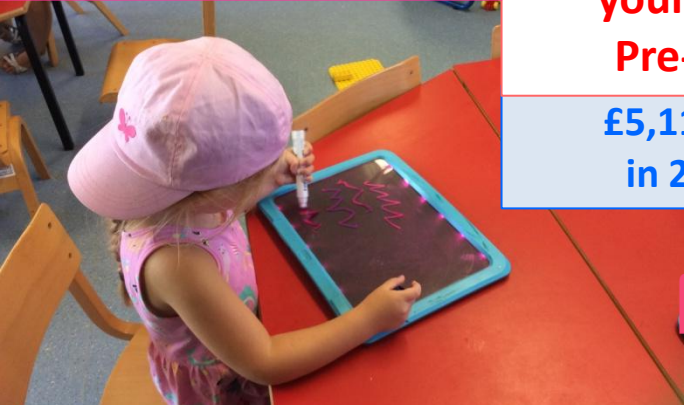
£145 for a set of LED writing boards